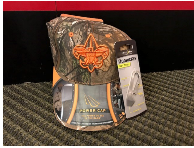
Week 2 – Hat & Doohickey