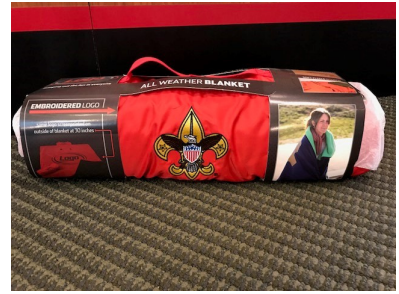
Week 3 – All Weather Blanket