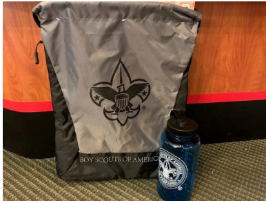
Week 1 – Bag & Bottle