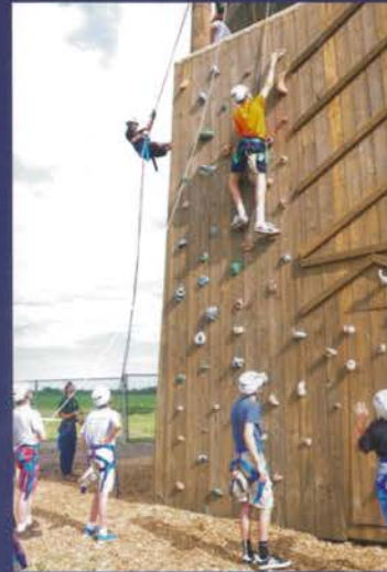
Our camp card program increased by 20% to $312,045. 113 Cub Scouts and 87 Boy Scouts attended camp for free. A value of over $44,700.