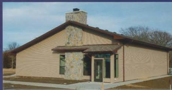
At Camp Cedars we completed construction on a multi-purpose facility in the COPE and equestrian area. The building consists of a bunkhouse, showers, restrooms and a FEMA-rated storm shelter.