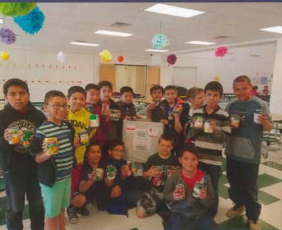
599 kindergartners joined the Lion pilot program throughout 100 Packs in our Council. We are looking forward to growth again in 2017.