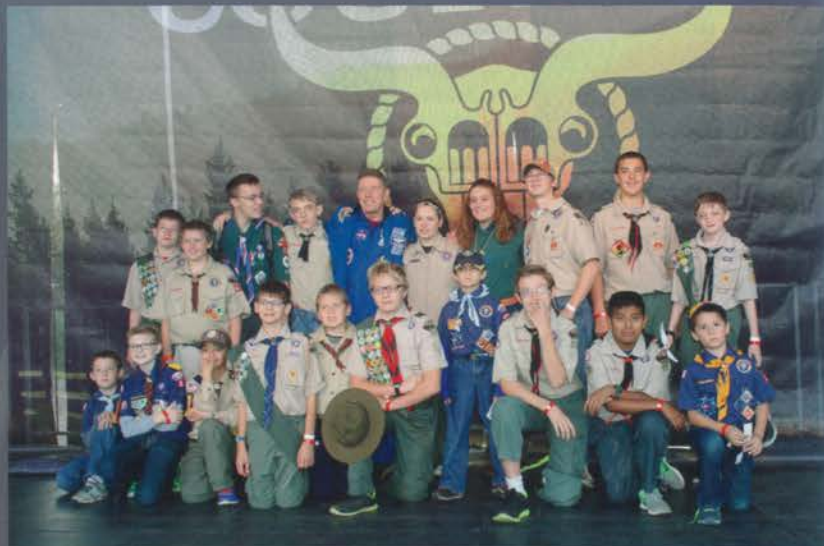
On October 16, 2016 a group of Scouts connected with Astronaut Kate Rubins while she was in space on the Soyuz MS-01. This group photo was sent to the International Space Station.