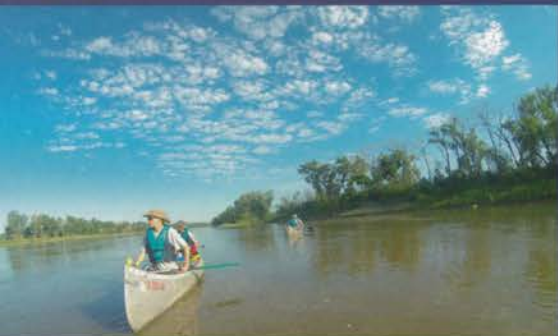
A backpacking option was added in the summer of 2016 to our nationally accredited High Adventure Base at Little Sioux Scout Ranch.